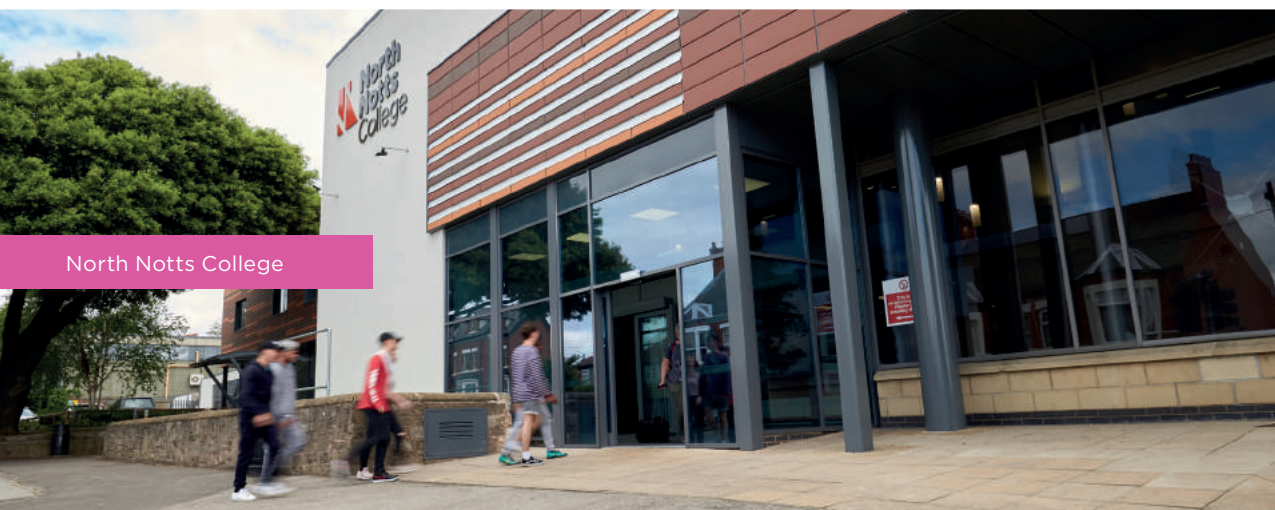
North Notts College