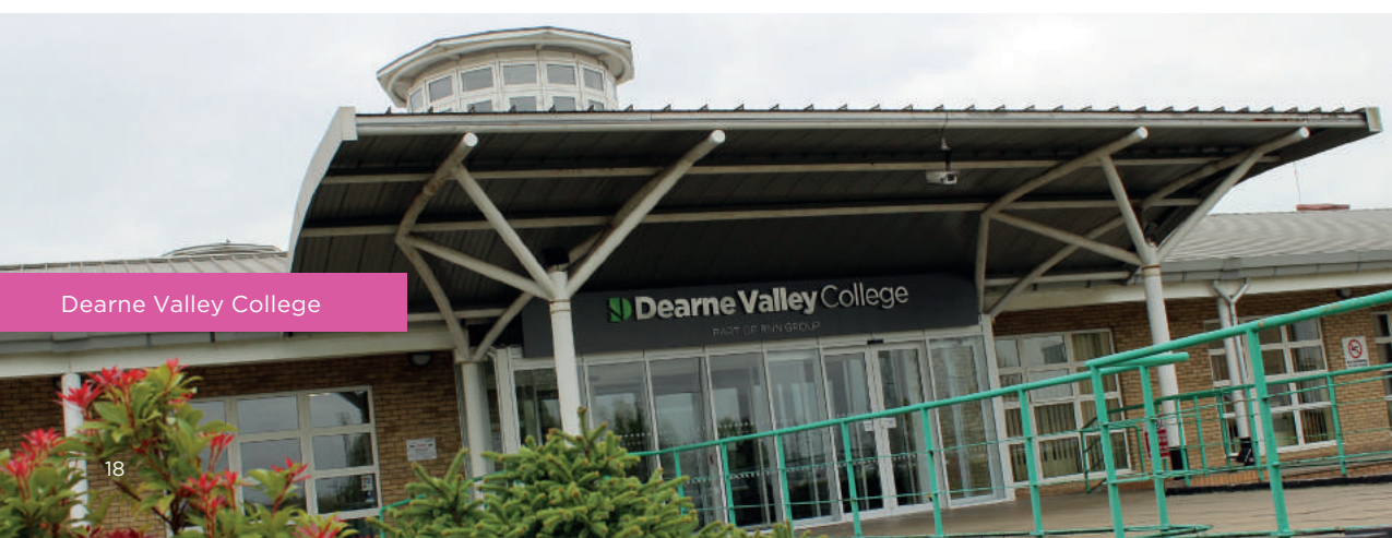
Dearne Valley College

University Centre Rotherham is part of the RNN Group alongside Rotherham College, North Notts College, Dearne Valley College, and a number of other subsidiary training organisations.